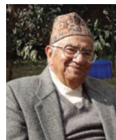
(2 September 1929 - 29 December 2016)

The old cataloguer of Nepal Mr. Kamal Mani Dixit passed away at his resident at the age of 87 on 29 December 2016. Veteran litterateur and Chairman of Madan Puraskar Pustakalaya and Madan Puraskar Guthi Mr. Dixit had important contributions in Nepalese library and Nepali literature. He has played a pivotal role in uplifting the Nepalese library with modern and innovative technologies and concept in Nepali literature with the publications of more than six dozens of books as well as numerous short stories and essays. The long-serving master of Nepalese library contributed until his last breathe.