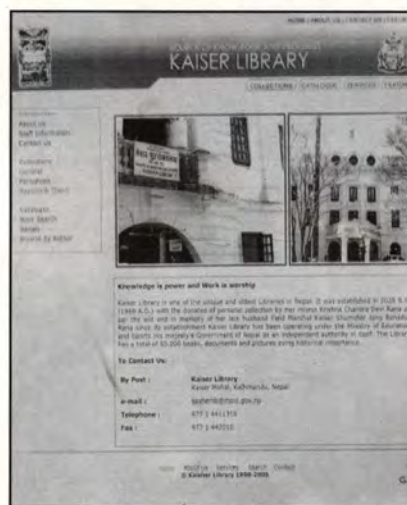
Homepage of KLIB

The bibliographic descriptions of the English language