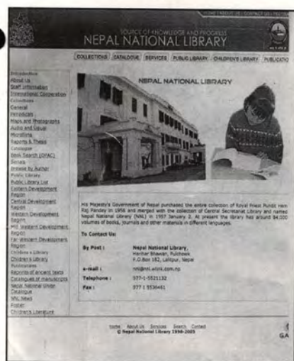
Homepage of NNL

Attempts were made by the Nepal National Library (NNL) to index its collection into manual card catalogue since past three decades. In this 21 st century, the NNL realized that the users are reluctant to use the traditional catalogue system and began to automate its bibliographic database in an electronic form. The budget comes from the same heading to Nepal National Library (NNL) and Kaiser Library (KLIB). NNL therefore decided to automate the holdings of the KLIB as well in the same way.