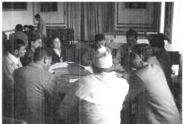
Participants in group work

On the occasion of its 50 th Anniversary NNL organized a half day workshop on library policy on 3 rd January 2006. The workshop was organized keeping in view the lack of library policy in Nepal even in this age of information and communication. The expected participants were about 40 including library professionals, policy makers, bureaucrats etc. However 25 participants took part in the programme. In the morning of 3 rd January Mr. Dasharath Thapa, Chief of NNL presented a concept paper on library policy based on the policies of other countries.