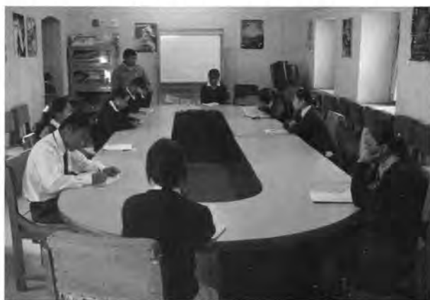
Participants in the essay competition

On the occasion of its 50 th Anniversary, NNL organized on the spot inter-school essay competition on December 9, 2005 (Mangsir 24, 2062). There were 18 participants from 9 different government schools of Lalitpur district. There were two participants from each school of grade 9 consisting of one girl and one boy except from Madan Memorial High School and Adarsha Kanya High School which has only girls. The essay competition was aimed at creating awareness about library among the school children of government schools. The topic was "Importance of library to the student life".