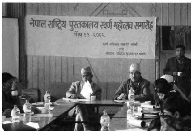
Joint Secretary chairing the programme