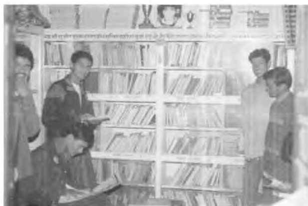
Users in the library