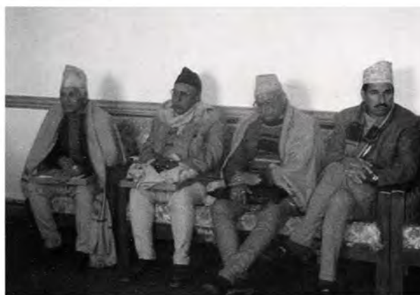
Ex-chairmen and Chief Librarian of NNL

On the same occasion, the Minister felicitated three ex-Chairmen of Nepal National Library, provided certificates to the staff of NNL who had started their service at this library and retired from the same and also to those staff who have served the library continuously for more than 15 years and lastly handed over