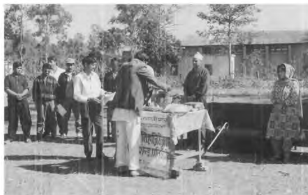
Quiz contest organised by the library