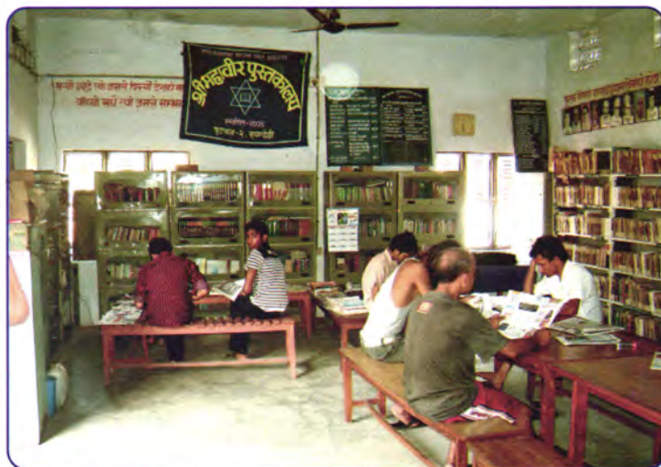
Users reading inside the library

Mahavir Library Mahavir Path, Butwal-2, Rupandehi, Nepal Ph.: 977-071-545299