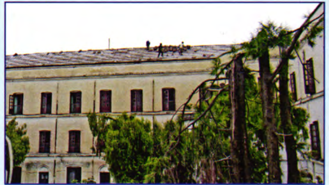
Roof under maintenance