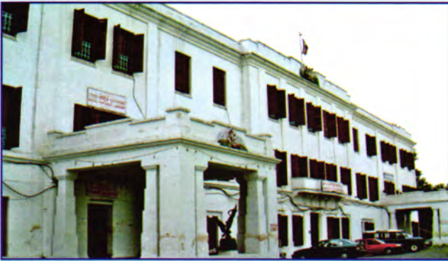
Front view of the building