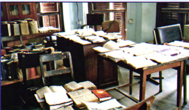
Drying soaked books