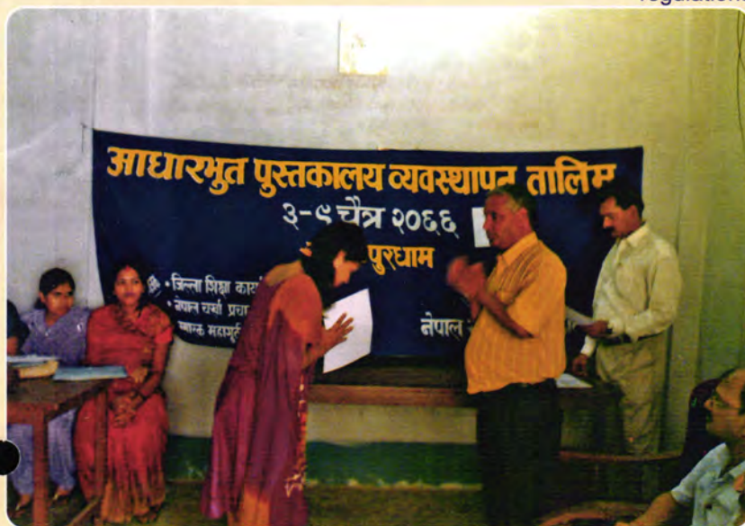
Chief guest distributing certificates

The content of the training programme includes introduction and history of library, book selection and acquisition, accessioning, classification, cataloguing, circulation, reference service and other aspects like library rules and regulations, use of computer in library, library furniture etc.