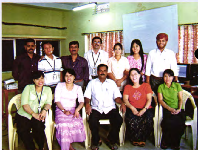
Participants of the training

The contents of the training were overall management of the library, theoretical and practical sessions of library automation programmes like WINISIS, GENISIS and digital library software like Greenstone Digital Library along with some visit to some important libraries.