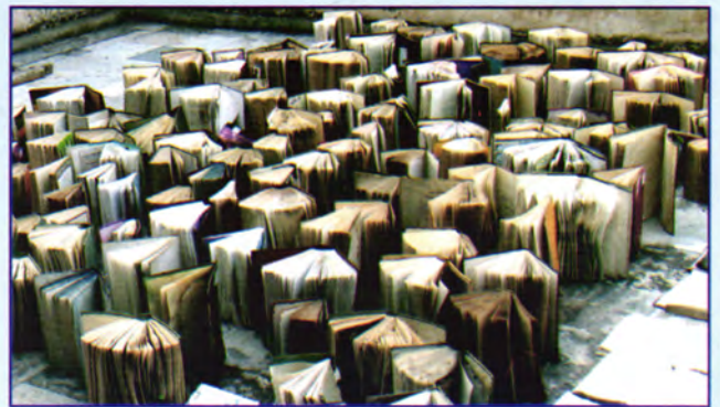
Drying soaked books