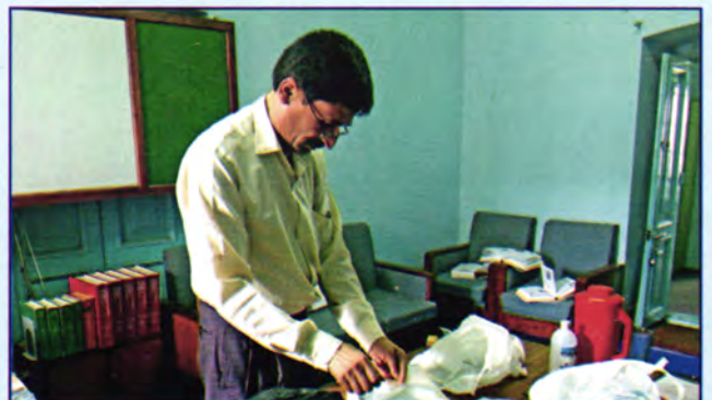
Wrapping up insect infected books