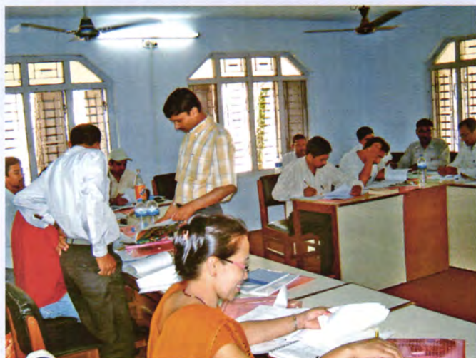
Practical session of the training at Butwal