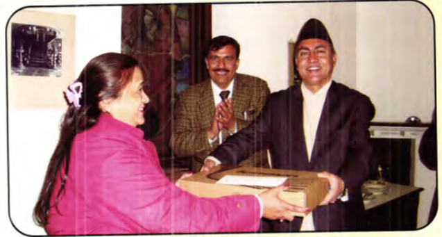
Education Secretary handing over the equipments to the chief librarian.