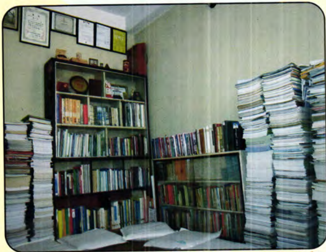
Rupantar an Nepals Coording on Office in Kathmandu

Keeping in mind the above mentioned fact, a group of youth has established 'Rupantaran Nepal (RN), in 2008. It is a social organization aiming to do some works in rural areas, voluntarily, to bring change in our society primarily in Dailekh district. It has started to work from the bottom, with the initiatives of local community and their active participation where they can own and drive the transformation process of the society. The concept is based on two principles 'From Community to Community' and 'Within the Community'. RN wants to mobilize one community for the help of other and the community itself to seek possibility of changes within. It aims to make aware the youth, women and marginalized and them help to bring into mainstream of development. This is also an idea to serve back to rural place, the deprived ones, where our little initiative can play a catalytic role in the inclusive development process.