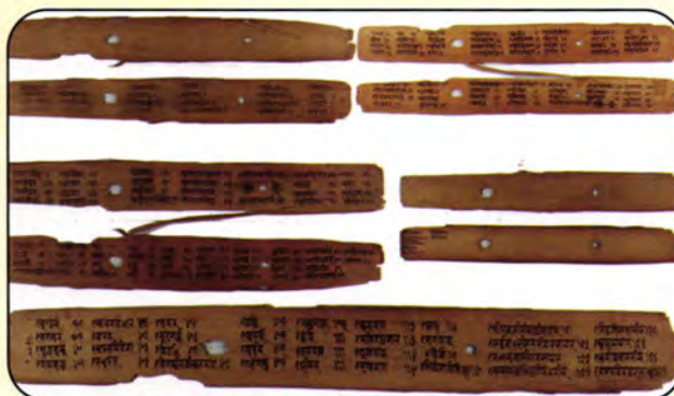
Table of Contents of Susruta Samhita

Nepal National Commission for UNESCO has constituted Nepal National Memory of the World Committee on 18th February, 2011. It comprises of eight members. The tenure of the members of the committee is four year. The committee has developed its working procedure for exploring Nepalese documentary heritages and to list them in National Memory Register. By the end of March 2012, the committee has selected 49 rare documents and listed them in the National Memory Register. It has also submitted two nominations of documentary heritages developed by National Archives and Kaiser Library to Memory of the World Committee, UNESCO Paris for listing them in International Memory of the World Register.