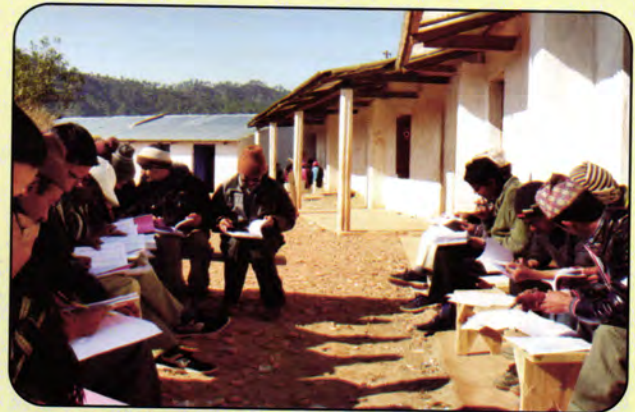
Participants of training on practical work

The sessions were organized in such a way that the participants could grasp the duties to be performed inside a library. There were both theories and practical sessions so that the participants could have enough time and chances to understand the concept clearly.