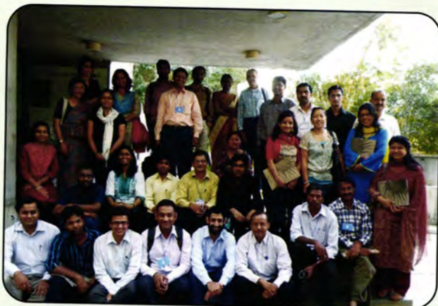
Group photo of the participants